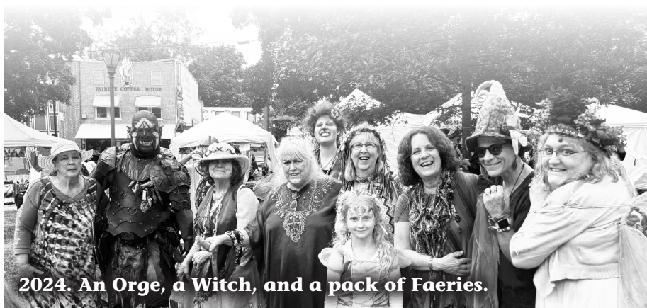
2024. An Orge, a Witch, and a pack of Faeries.